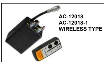
AC-12018 AC-12018-1 WIRELESS TYPE