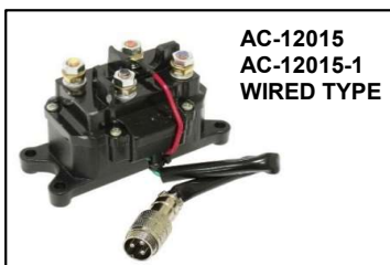
AC-12015 AC-12015-1 WIRED TYPE