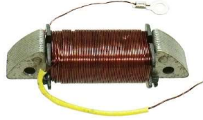
AT-01327 LIGHTING COIL