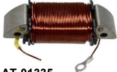
AT-01335 LIGHTING COIL